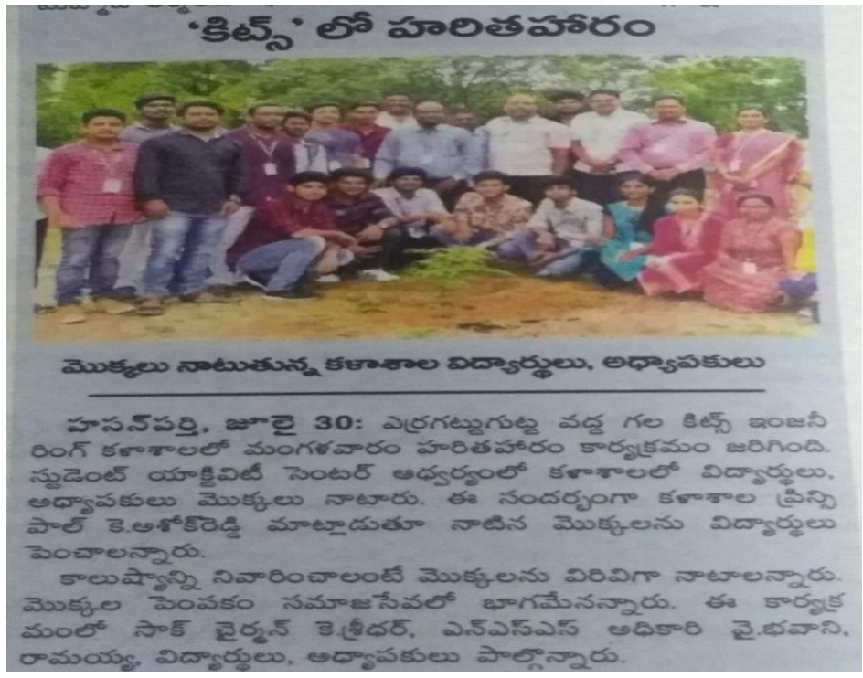
Tree plantation on 30 july 2019