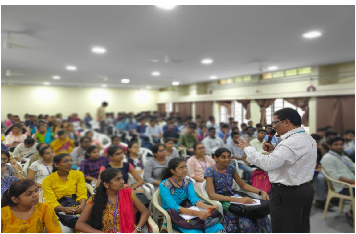
Student induction program 2019.