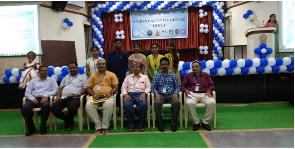
Student activity centre(SAC) inaugural 2019.