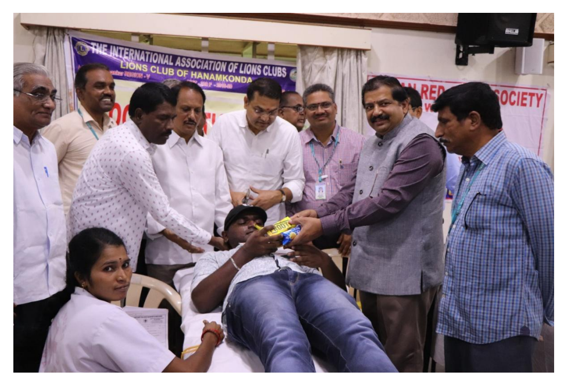
Blood donation camp on 24^{th} sep. 2019. On the occasion of national nss day.